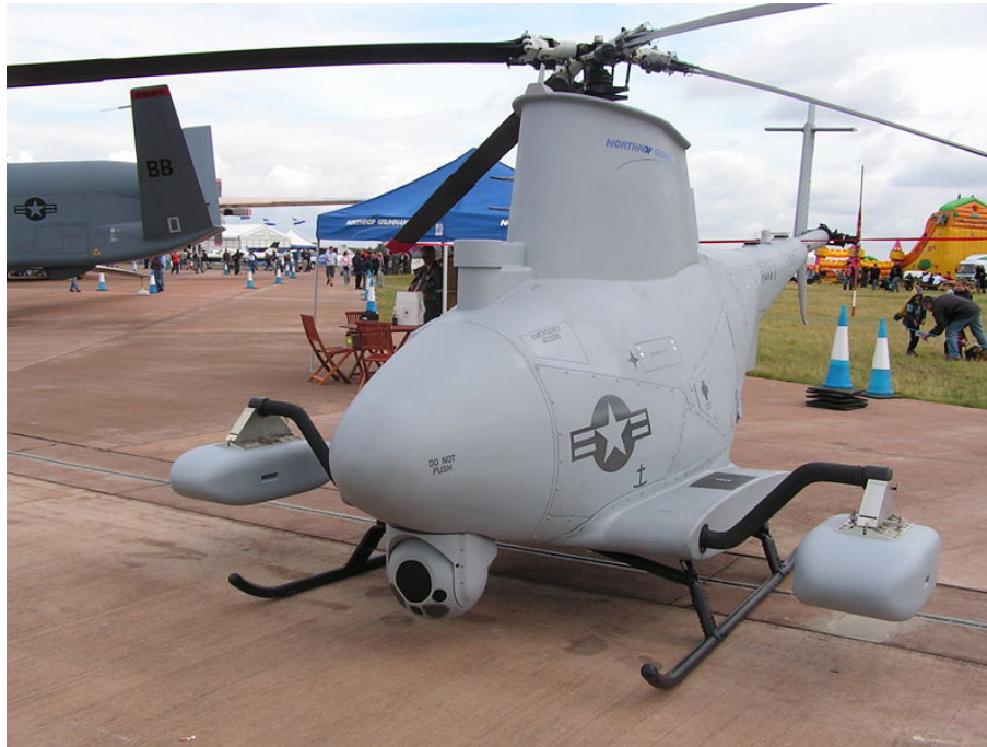
Figure 5. MQ-8B Fire Scout with Forward-looking Infrared Radar pod installed 8

positioning system (GPS) guidance and semi-active laser seeker. The Army views this versatile weapons package as ideal for the modern battlefield. In addition to its use as an armed platform, the Fire Scout can also be used to transport up to 200 pounds of emergency supplies to troops in the field.